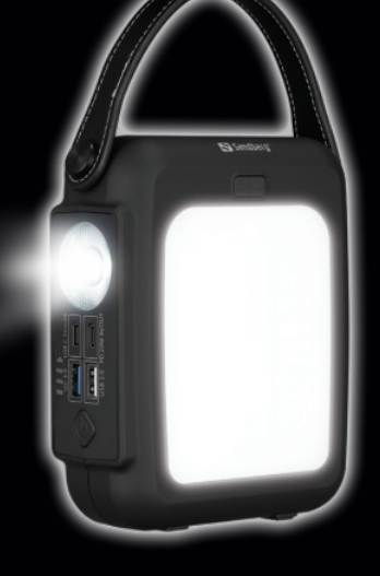
Item no. 420-79